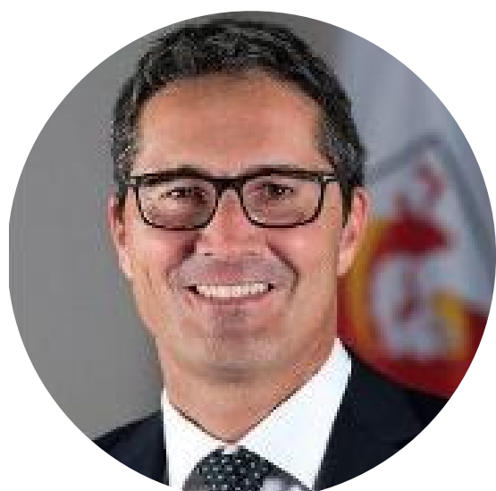
Arno Kompatscher - President of the Autonomous Province of Bolzano