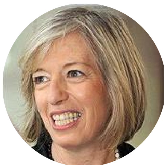
Stefania Giannini – Deputy Director of UNESCO; former Minister of Education