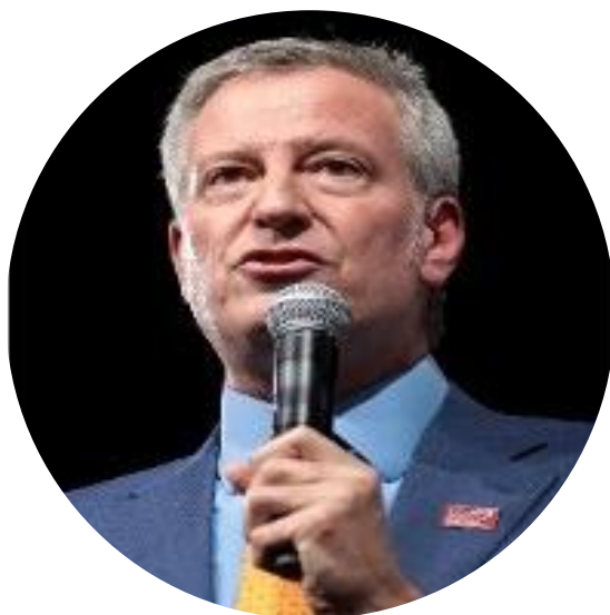
Bill de Blasio - Former Mayor of New York