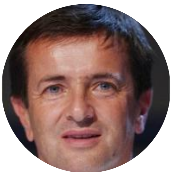
Giorgio Gori - Mayor of Bergamo