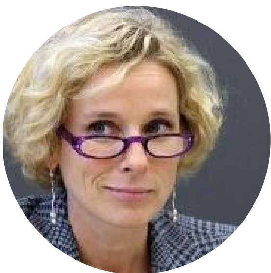
Giovanna Melandri - President of the MAXXI Foundation; President of Human Foundation