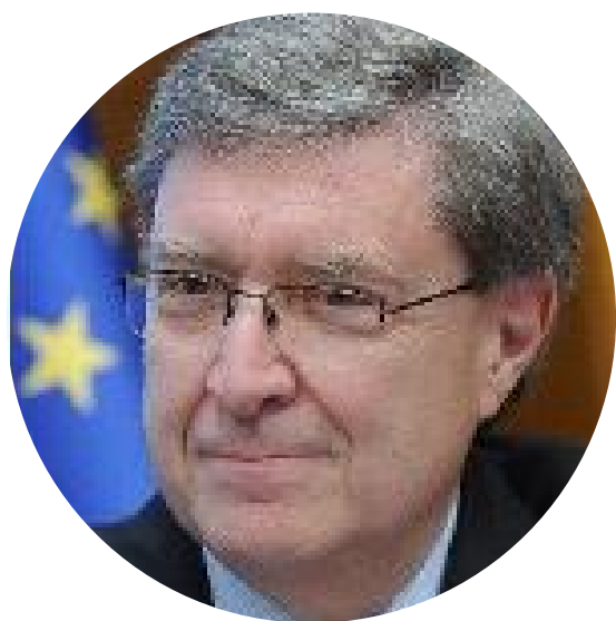
Enrico Giovannini - Minister for Sustainable Infrastructure and Mobility